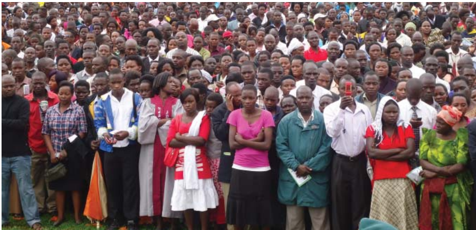
Over 30,000 Christians volunteered the morning heavy down power to attend the 2013 Corporate Prayer on 6th.Jan. at Nakivubo Stadium