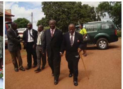
Left: Some of the elderly men & women attending the Elderly day out at Prime Radio; Right, is Hon. Joash Mayanja Nkangi welcomed to the occasion by the Bishop, CUC