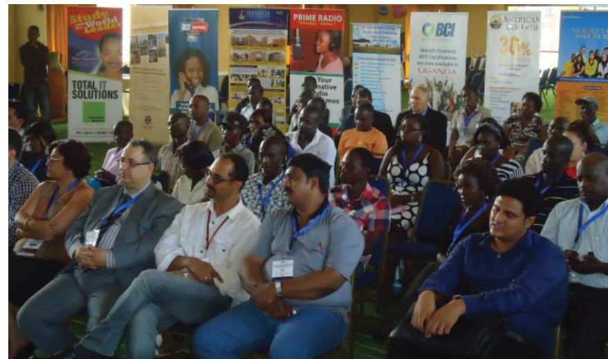
Business Tycoons around Kampala converged at Equatorial Hotel to discuss how to promote their businesses. Prime Radio was also part of the team.