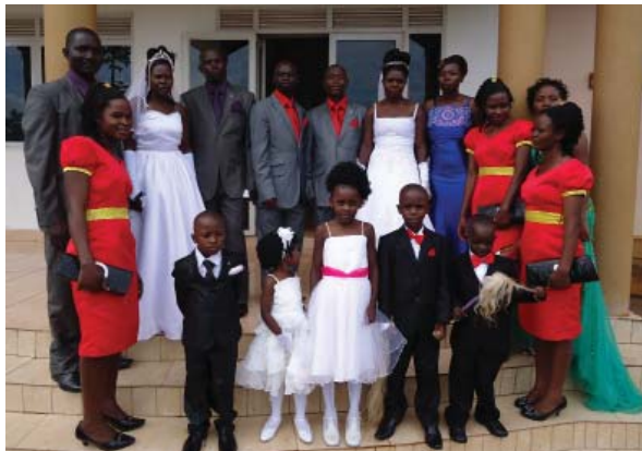
Embaga za Lwaki Nze2012