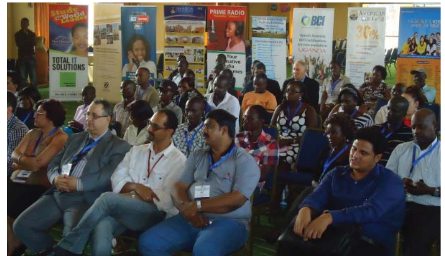
Business Tycoons around Kampala converged at Equatorial Hotel to discuss how to promote their businesses. Prime Radio was also part of the team.