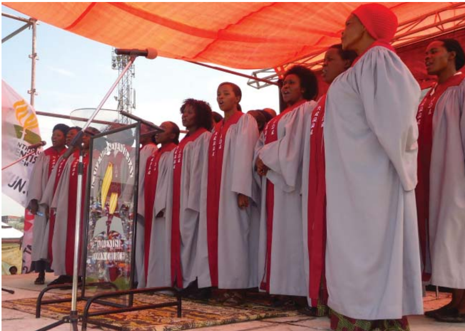
and departments especially for women and children. Najja SDA Church Choir Performed During the Prayers at Nakivubo Stadium

9. Church Related Promotions , we have continued to avail airtime to promotions activities organized by the local churches, districts