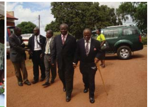
Left: Some of the elderly men & women attending the Elderly day out at Prime Radio; Right, is Hon. Joash Mayanja Nkangi welcomed to the occasion by the Bishop, CUC