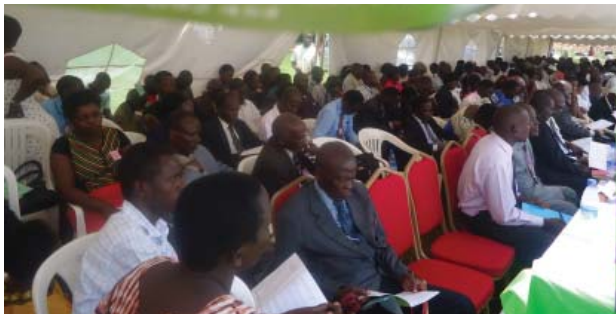
1000s Attending Akezimbira 2013 Convention. The Program runs every Sunday on Prime Radio